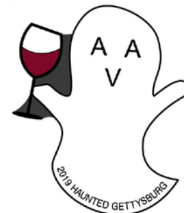
"A" Award is a 1" Hat Pin