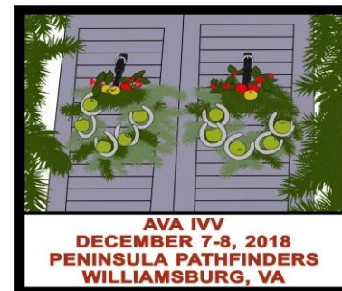
Williamsburg 2018 Night Award

AVA SPECIAL PROGRAMS: These walks qualify for the following special AVA programs: Amphitheatres, Boardwalks. Bridges - Spanning the USA, Ice Cream Parlors, Path of Inventions, Points of Reference, Take a Walk in a City Park, Trekking with Trees, Vice Presidential Walks, and Walking the USA - Street by Street. Virginia Cities Program: Williamsburg.