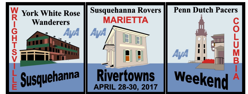
Three separate Patches - One for each walking event.

Wrightsville PA AT17/106621 York County Marietta PA AT17/106617 Lancaster County Columbia PA AT17/106957 Lancaster County Columbia PA Bike AT17/106958